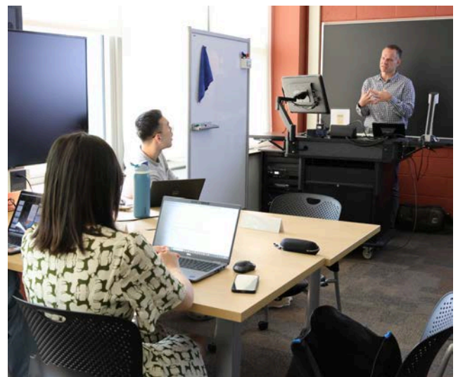
The ICPSR Summer Program

in to preserve access to vital data. Through DataLumos, ICPSR has facilitated the rescue and preservation of high-value datasets essential to the social sciences, preserving data for use by future generations, and ensuring researchers' data can be utilized for decades to come. As of mid-2025, DataLumos has published more than 800 projects containing at-risk data.