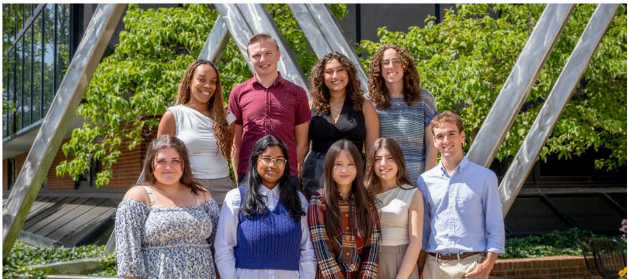
The 2024 Junior Professional Researcher cohort

Meanwhile, the Junior Professional Researcher (JPR) Program brings recent college graduates directly into the research community by pairing them with research projects being conducted at the Institute for Social Research.